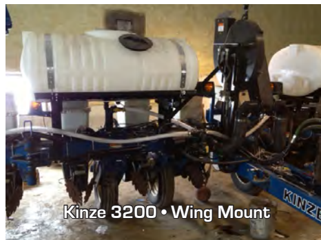
Kinze 3200 • Wing Mount