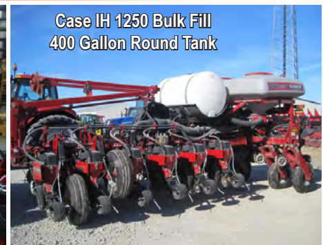
Case IH 1250 Bulk Fill 400 Gallon Round Tank