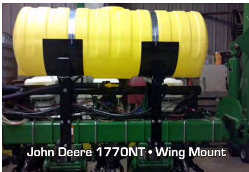
John Deere 1770NT • Wing Mount