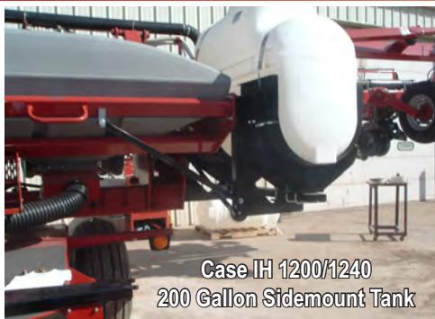
Case IH 1200/1240 200 Gallon Sidemount Tank