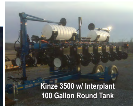
Kinze 3500 w/ Interplant 100 Gallon Round Tank

Neither Sprayer Specialties, Inc. nor the tank manufacturers except liability for damage to planters of any make or model due to fluid or weight capacities deemed in excess of what the planter manufacturer(s) state as acceptable for their specific model or brand. Please consult the planter manufacturer directly to get specific weight carrying capacities of your make and model of planter. Neither Sprayer Specialties, Inc. nor the tank manufacturer(s) except responsibility for damage to planters associated with mounting or failure of planter brackets and tanks or for the loss of any fluid due to tank or planter bracket failure