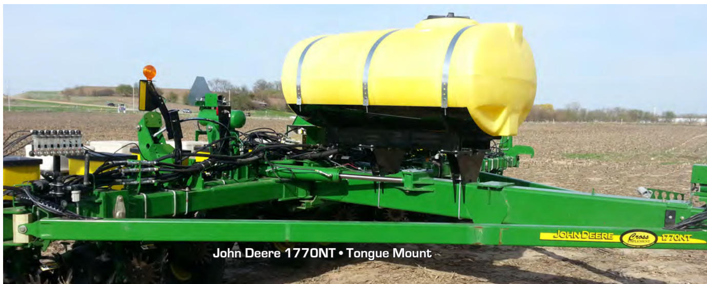
John Deere 1770NT • Tongue Mount