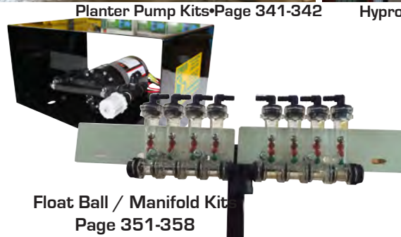
Float Ball / Manifold Kit Page 351-358