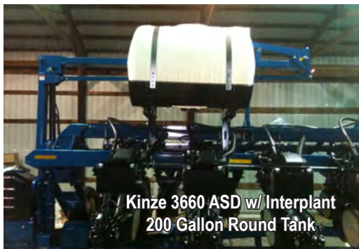
Kinze 3660 ASD w/ Interplant 200 Gallon Round Tank