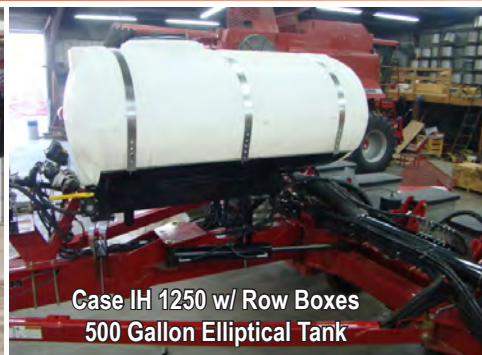
Case IH 1250 w/ Row Boxes 500 Gallon Elliptical Tank