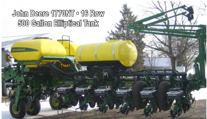
John Deere 1770NT • 16 Row 500 Gallon Elliptical Tank