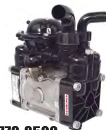
Hydro Diaphragm Pumps Common On CASE IH Planters Page 279