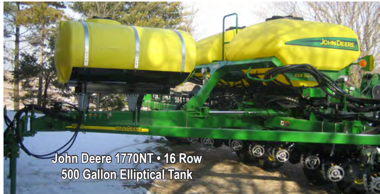
John Deere 1770NT • 16 Row 500 Gallon Elliptical Tank