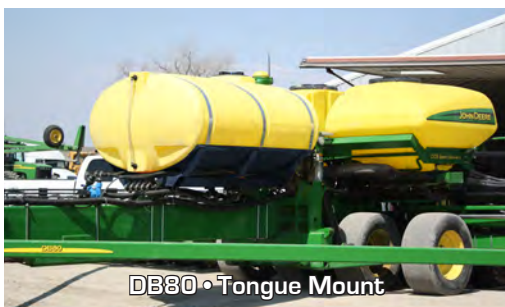
D380 • Tongue Mount