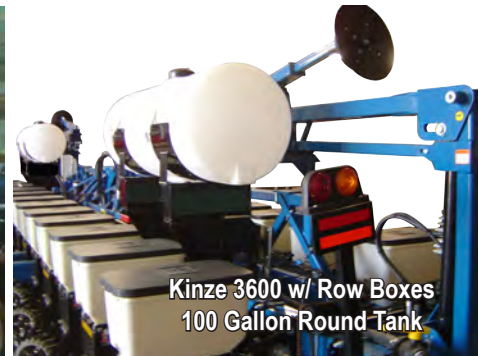
Kinze 3600 w/ Row Boxes 100 Gallon Round Tank