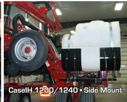
Case IH 1200/1240 • Side Mount