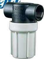
AA122-PP Compact Liquid Strainer List Price $22.81

The AA122 line strainer features a compact size that is well suited for small agricultural and turf sprayers. The AA122 is constructed of polypropylene head and bowl with stainless steel screen for excellent chemical resistance and is available with 1/2" or 3/4" NPT pipe connections. The maximum pressure rating is 150 PSI.