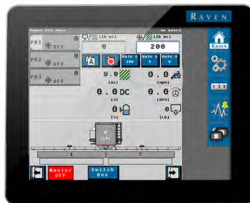
Viper 4 with New RCM Screen