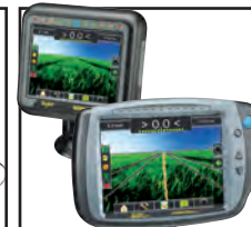
TeeJet MATRIX PROGS with Patch Antenna & Camera