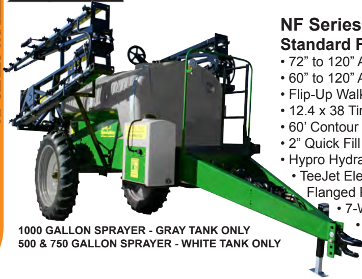
1000 GALLON SPRAYER - GRAY TANK ONLY 500 & 750 GALLON SPRAYER - WHITE TANK ONLY