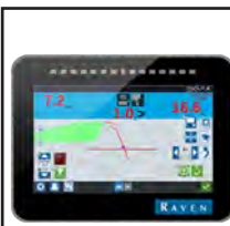
RAVEN CR7 NEW Guidance/Rate Controller Kit.