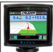
RAVEN Cruiser II Package with Patch Antenna