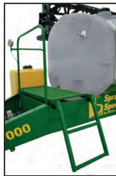
Front end walkway with fold-up steps are Standard on NF Series Sprayers Frames