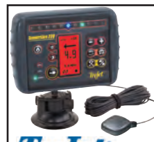
TeeJet CenterLine220 Package with Patch Antenna