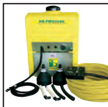
Optional High Output Foamer Includes Trailer Mounting Brackets and Hardware,