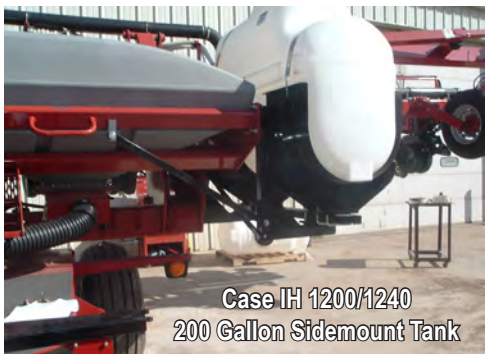
Case IH 1200/1240 200 Gallon Sidemount Tank