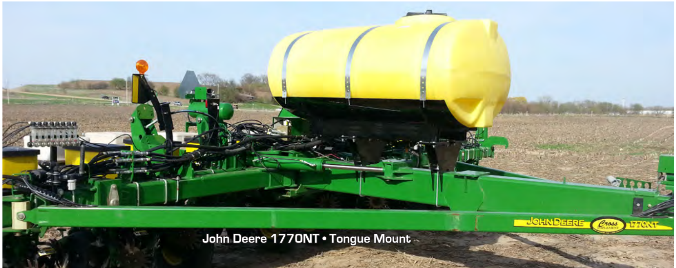
John Deere 1770NT • Tongue Mount