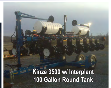
Kinze 3500 w/ Interplant 100 Gallon Round Tank

Neither Sprayer Specialties, Inc. nor the tank manufacturers accept liability for damage to planters of any make or model due to fluid or weight capacities deemed in excess of what the planter manufacturer(s) state as acceptable for their specific model or brand. Please consult the planter manufacturer directly to get specific weight carrying capacities of your make and model of planter. Neither Sprayer Specialties, Inc. nor the tank manufacturer(s) accept responsibility for damage to planters associated with mounting or failure of planter brackets and tanks or for the loss of any fluid due to tank or planter bracket failure.