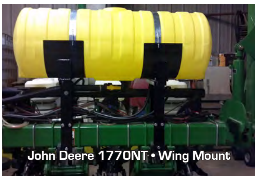
John Deere 1770NT • Wing Mount