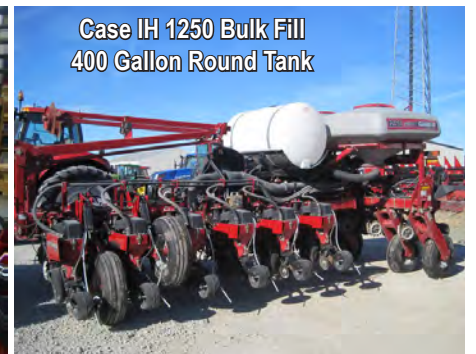
Case IH 1250 Bulk Fill 400 Gallon Round Tank