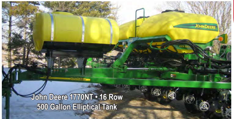
John Deere 1770NT • 16 Row 500 Gallon Elliptical Tank