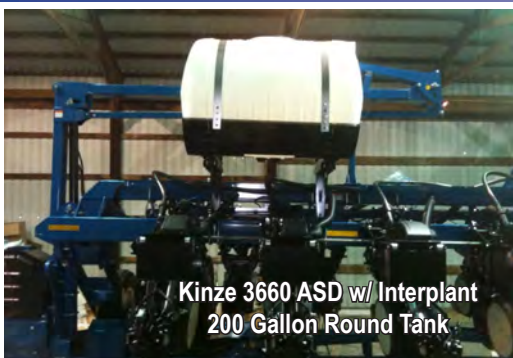
Kinze 3660 ASD w/ Interplant 200 Gallon Round Tank