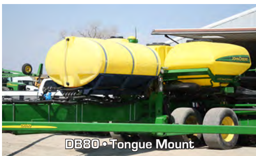
8380 • Tongue Mount