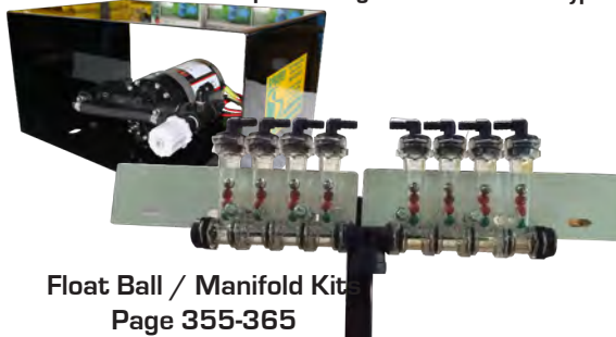
Float Ball / Manifold Kit Page 355-365

Hypro Diaphragm Pumps Common On CASE IH Planters Page 281