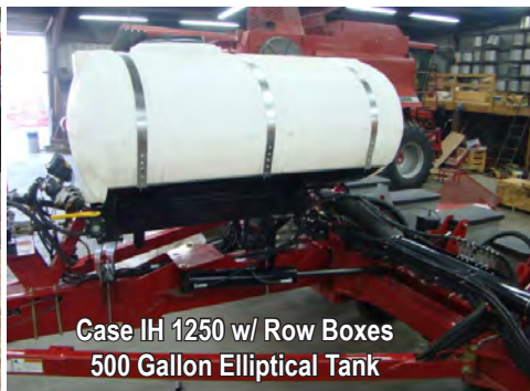
Case IH 1250 w/ Row Boxes 500 Gallon Elliptical Tank