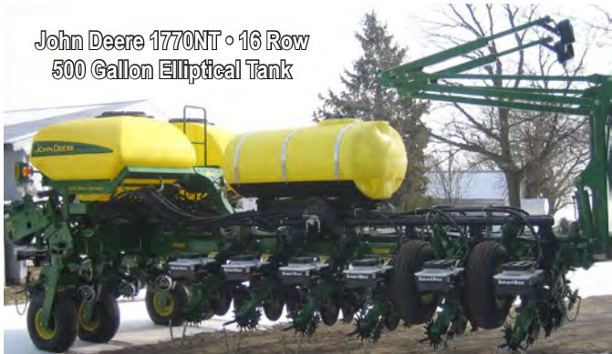
John Deere 1770NT • 16 Row 500 Gallon Elliptical Tank