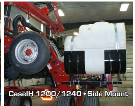
Case IH 1200/1240 • Side Mount