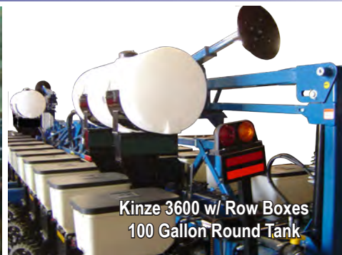
Kinze 3600 w/ Row Boxes 100 Gallon Round Tank