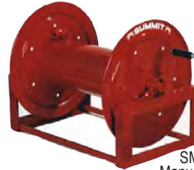
SM18 Manual Reel *Black is Stock Color