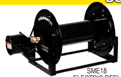
SME18 ELECTRIC REEL