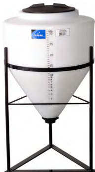
Parts Breakdown on Page 341