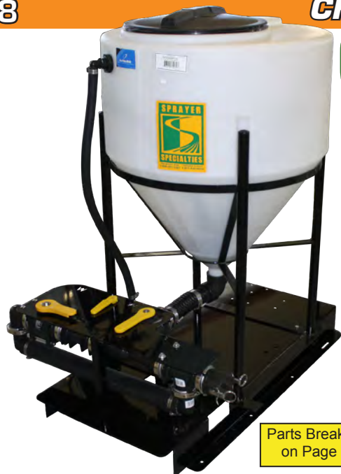
Parts Breakdown on Page 341